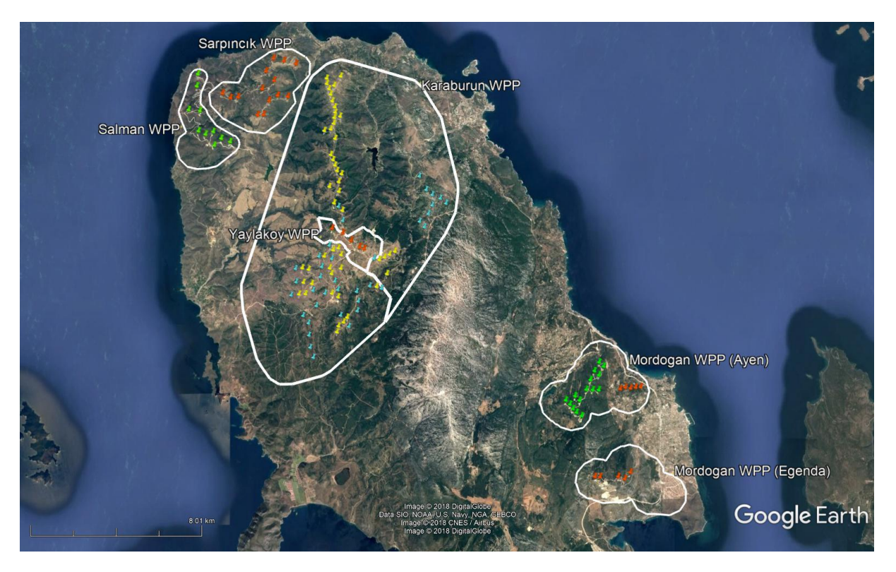
Figure 1.2: Location of the Existing and Planned WTGs