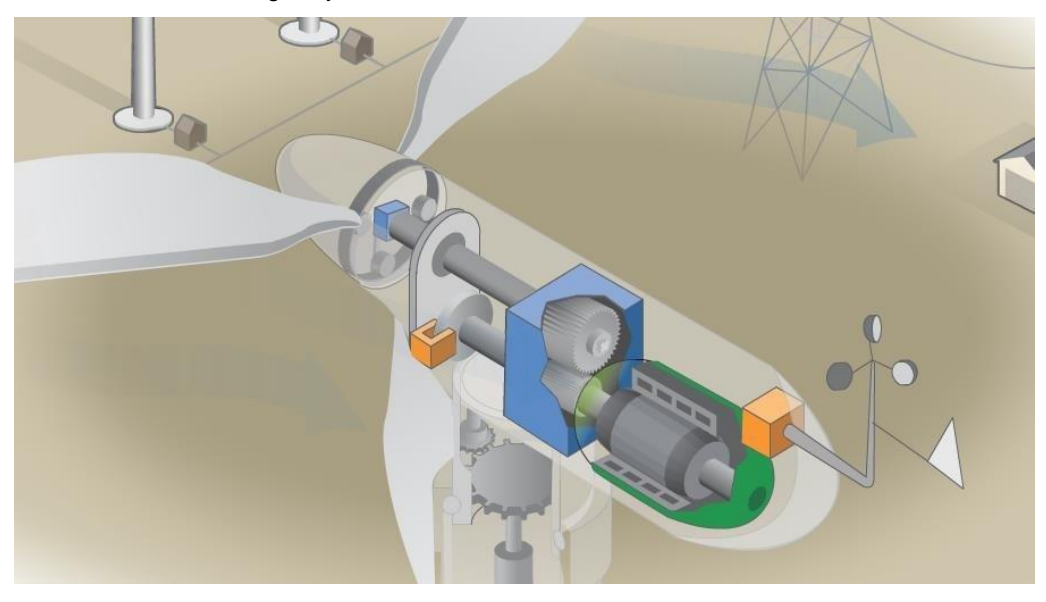
Figure 1.4 : Scheme of a Wind Turbine

Wind turbines operate on a simple principle. When wind blows, it carries kinetic energy which can move objects. A wind turbine has two or three propeller-like blades around a rotor; the blades are designed to rotate when hit by the wind. Wind turbines generally start operating at a wind speed of 3-5 meters per second (a gentle breeze); as the blades of the turbine spin they turn a shaft in the nacelle (the box on top of a wind turbine), this spins a generator (also built into the nacelle) to create electricity. The generated power is then regulated by a transformer to the right voltage and fed into the national grid system.