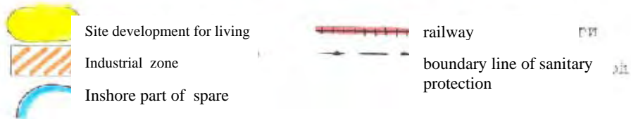
Figure 2 "Coal complex "Vaninsky bulk terminal" of "Daltransugol" Limited